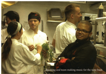
Mooking and team making music for the taste buds